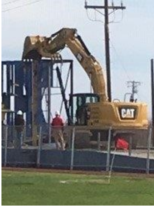
Demolition of old press box

Out with the old and in with the new. Gregg LeMaster Field is getting a new look with a new press box and new grandstand seating.