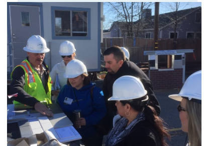
CBOC Committee Members working with Contractor on final finishes for the Arbuckle Elementary School's New

Photographs of Current Projects Measure B Project Matrix Schedule