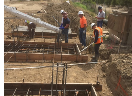
New Concrete Foundations being placed by Contractor

Project includes seating for 780 spectators, ADA seating spaces and new scoreboard. New walkways will be provided with new LED walkway lighting. Stadium Bleachers and Scoreboard will have great visibility from Interstate 5 and provide for safe and compliant viewing of all sports activities.