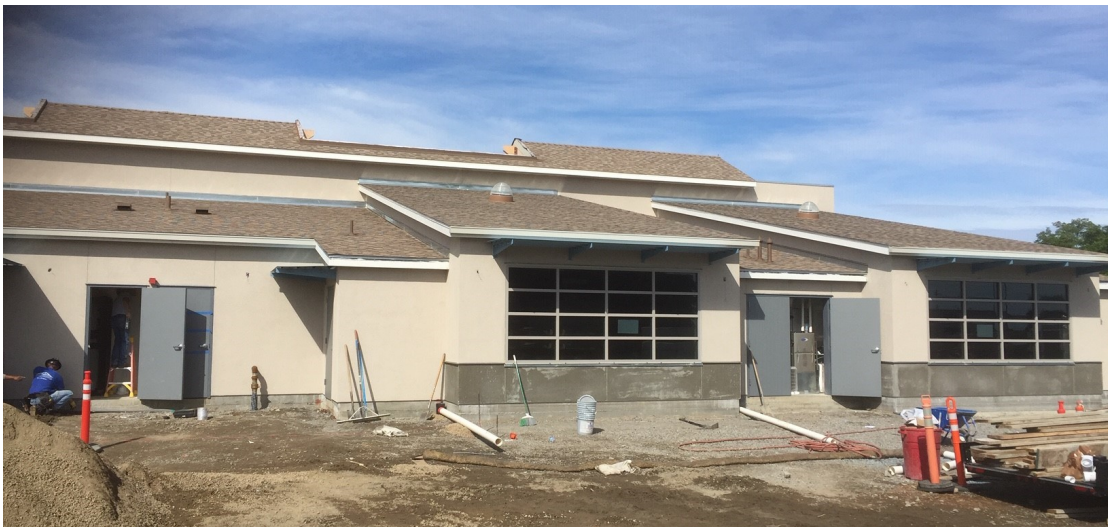
Progress Photo of the New Classroom Building